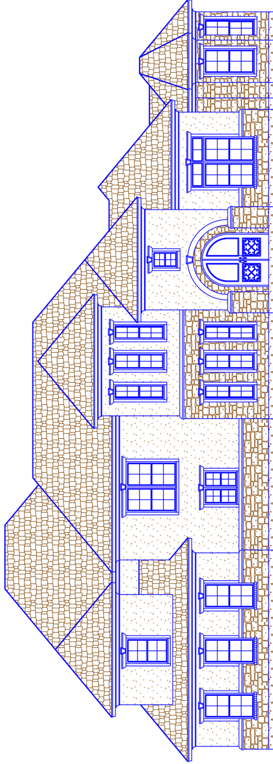
○ FRONT ELEVATION

PLAN I.D. 3500 Blue Line Design Co. Copyright 2009