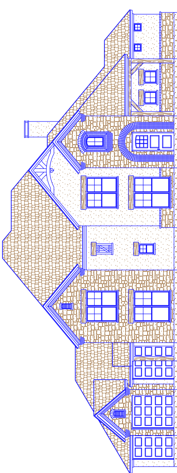
○ FRONT ELEVATION