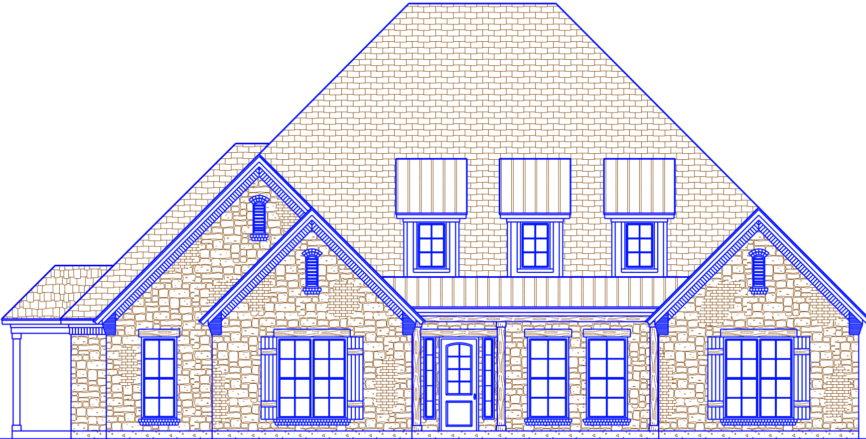
○ FRONT ELEVATION