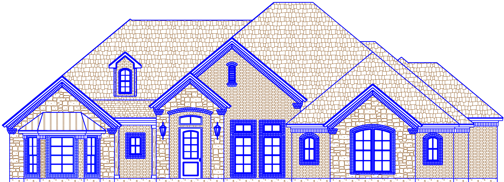
○ FRONT ELEVATION