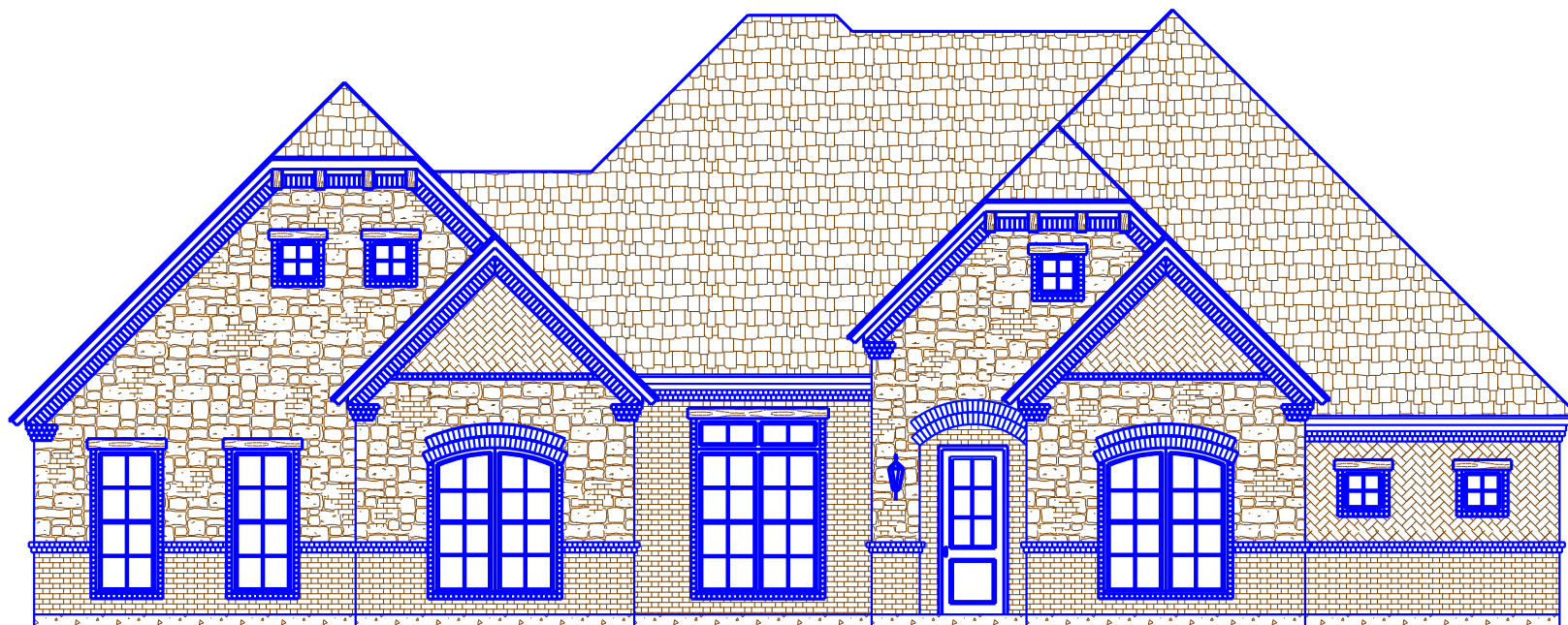
○ FRONT ELEVATION

PLAN I.D. 2684 Blue Line Design Co. Copyright 2016