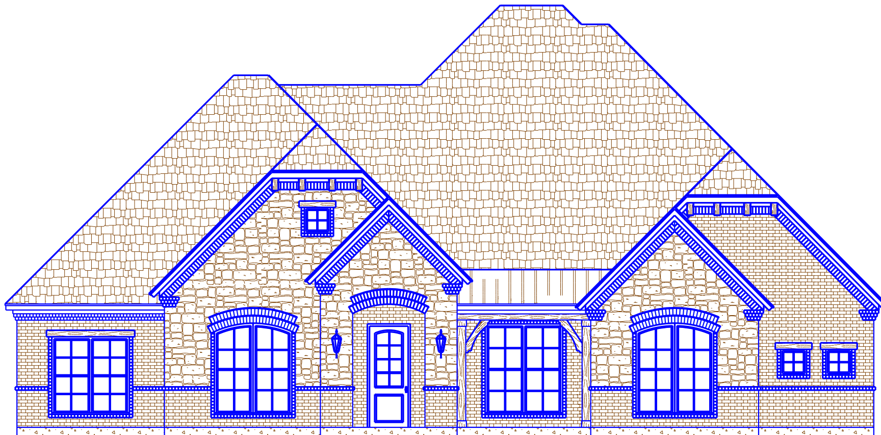
○ FRONT ELEVATION