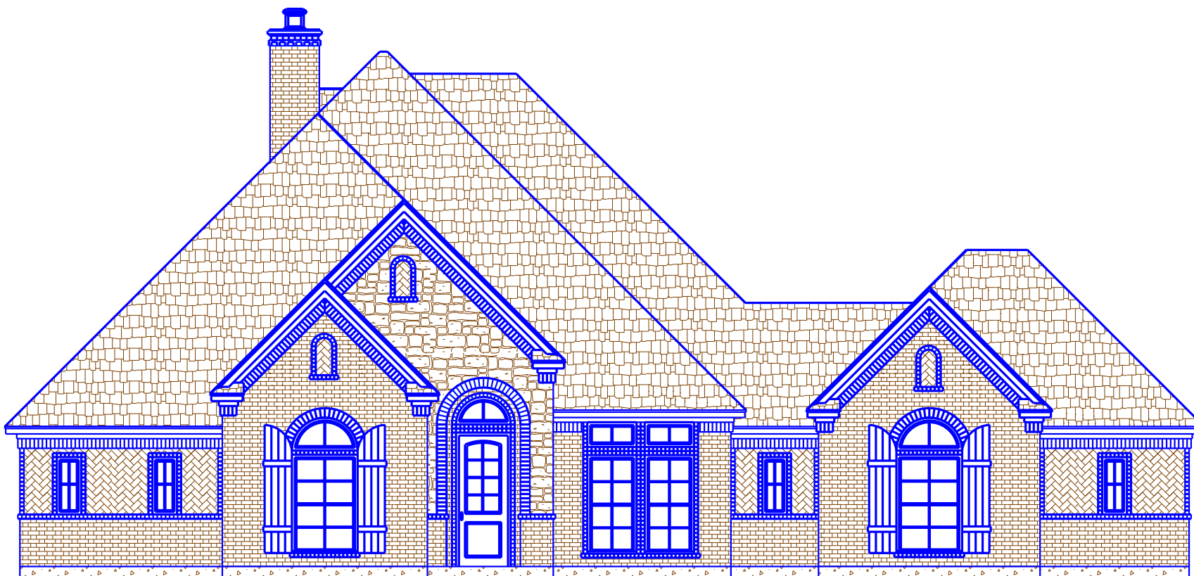
○ FRONT ELEVATION