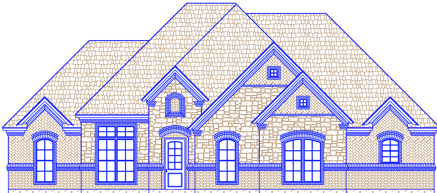
○ FRONT ELEVATION