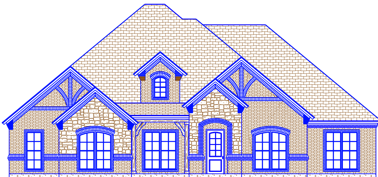
○ FRONT ELEVATION