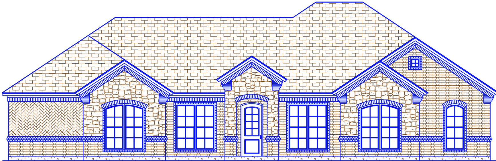
○ FRONT ELEVATION