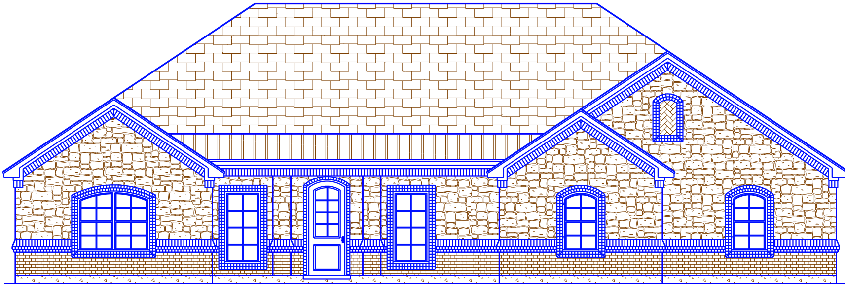
○ FRONT ELEVATION