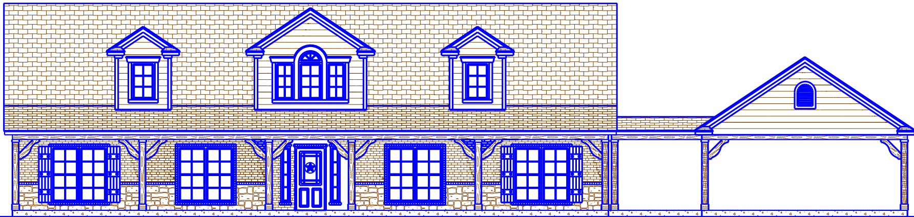
○ FRONT ELEVATION