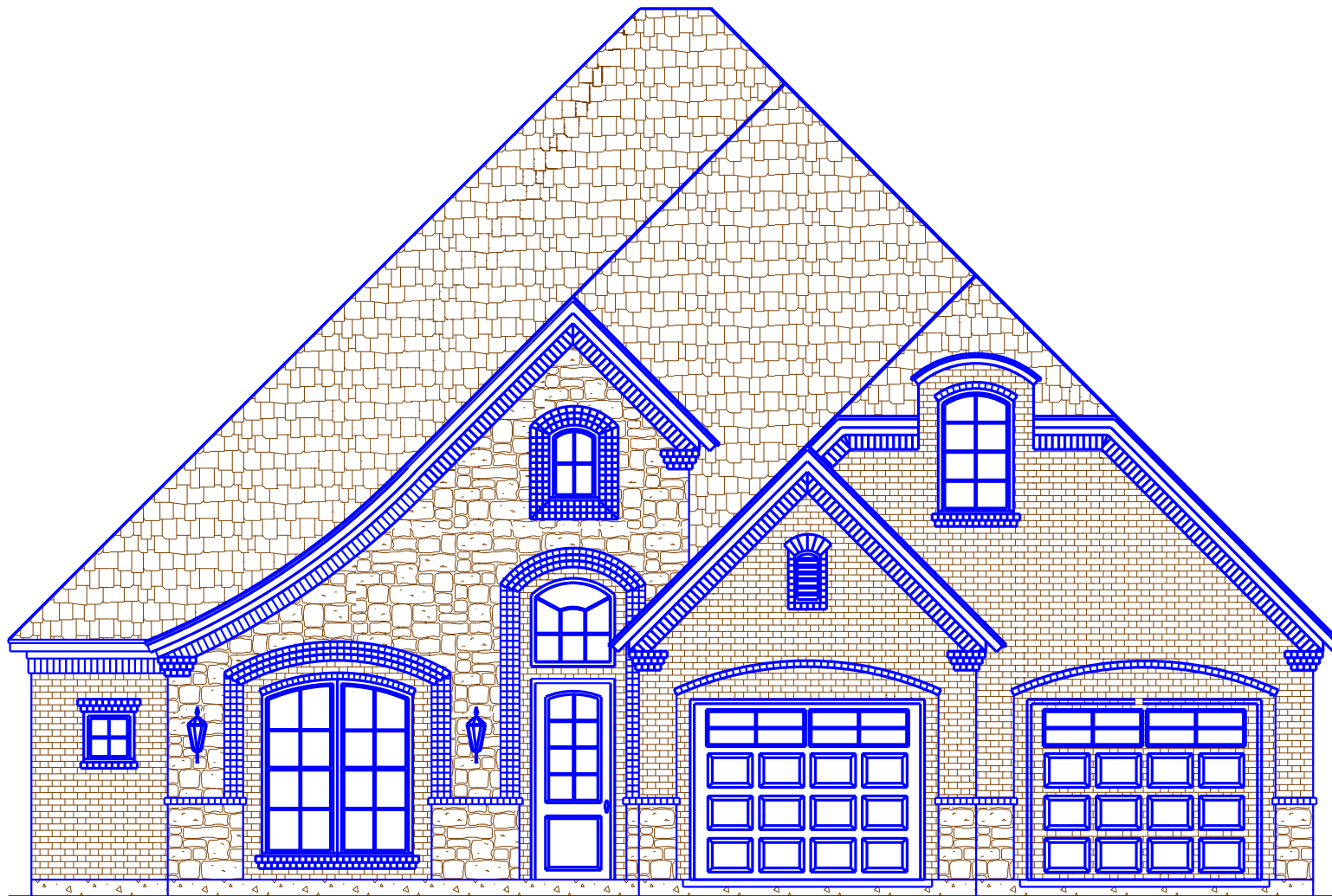
○ FRONT ELEVATION