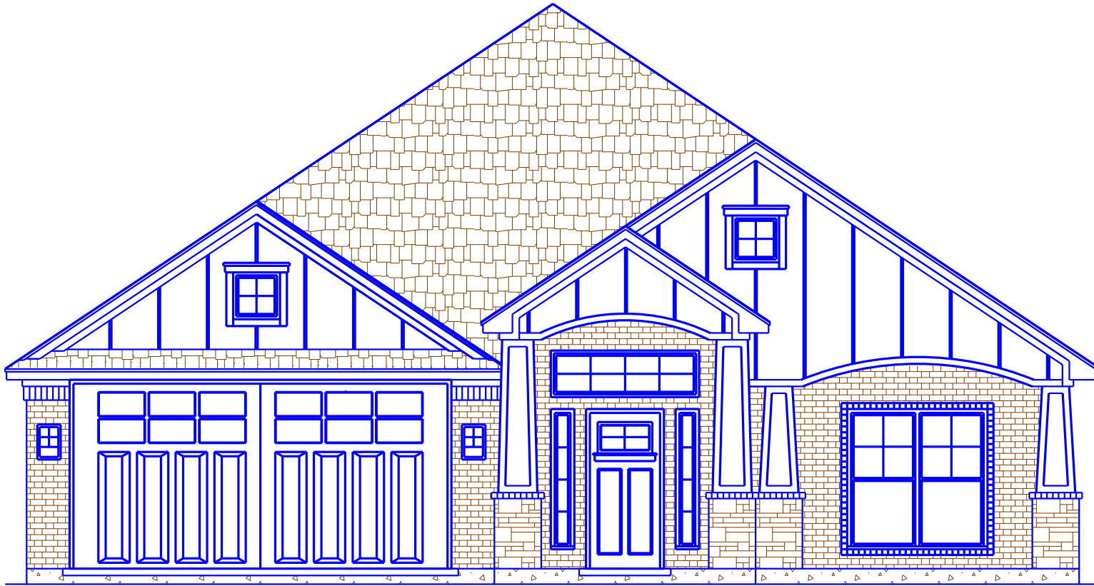
○ FRONT ELEVATION