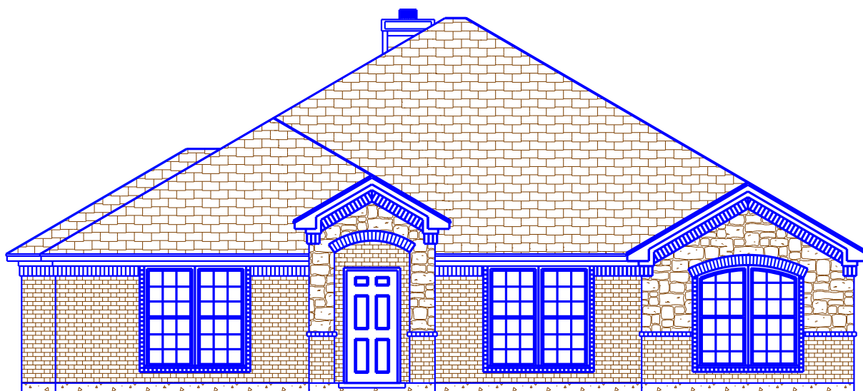
C FRONT ELEVATION