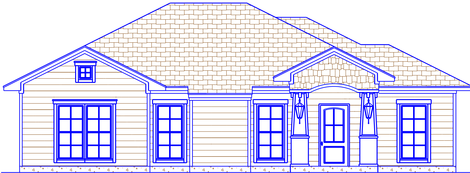
○ FRONT ELEVATION